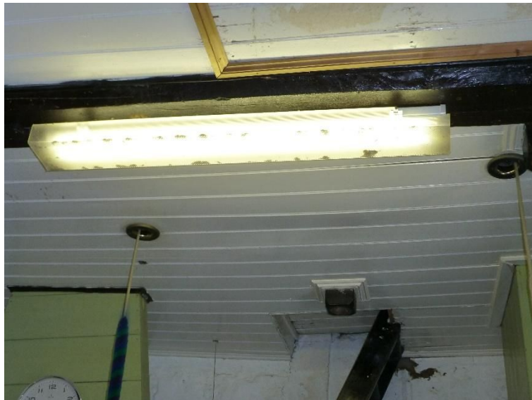
The picture above shows a typical strip light with diffuser, now with some debris building up.

Shading – The light must be diffuse; depending on the source, diffusers may be required. Many modern sources are much more intense and directional than traditional bulbs so care is required when installing new fittings at the same location as a previous lamp. The style of shade also requires careful selection. If dust, insects, spiders or other debris can easily collect in a shade or diffuser, this will soon reduce the light efficiency and potentially become a fire hazard. Ringers should not be expected to clean out lamp shades, at frequent intervals.